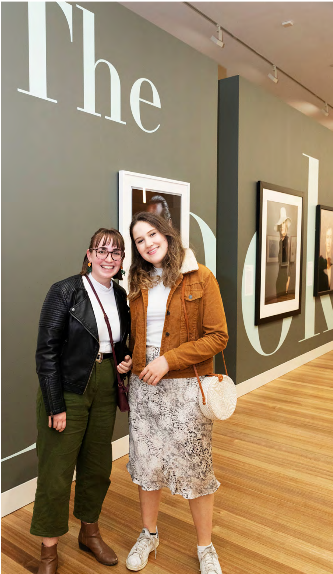
Guests at the Fresh Faces preview of The Look .